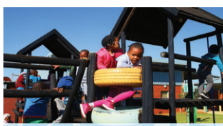
EARLY CHILDHOOD DEVELOPMENT