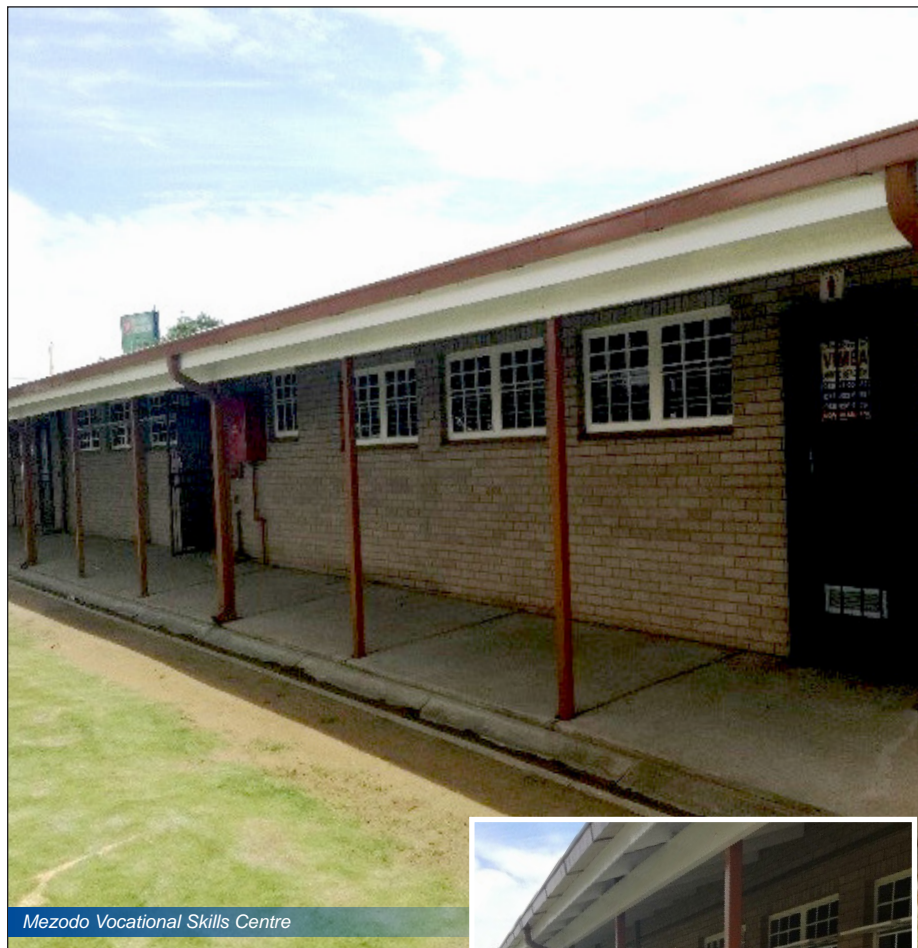
Mezodo Vocational Skills Centre

The work done at the school included: ceiling tile installation, floor sheeting, wall painting