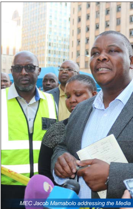
MEC Jacob Mamabolo addressing the Media

The Johannesburg Central District has been a beehive of mass movement of employees over the month of September as public servants from the eight evacuated buildings and the torched Bank of Lisbon moved into alternative offices to share space with colleagues while the both the procurement of new office space and the parallel OHS compliance process.