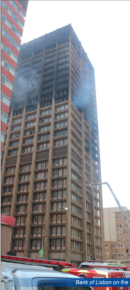
Bank of Lisbon on fire