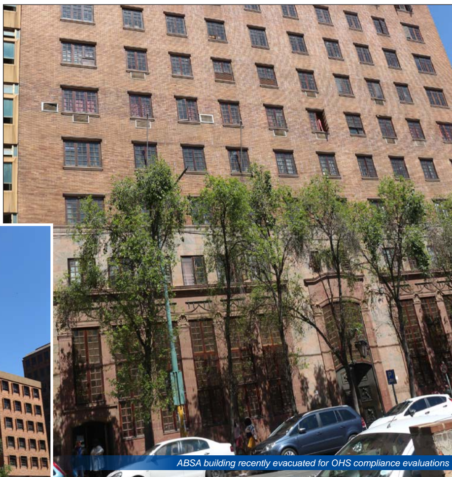
ABSA building recently evacuated for OHS compliance evaluations