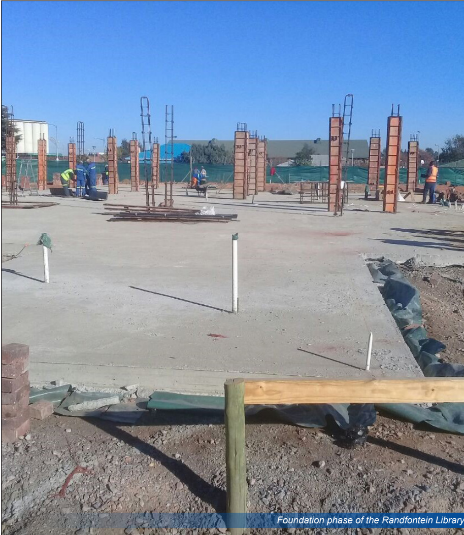
Foundation phase of the Randfontein Library