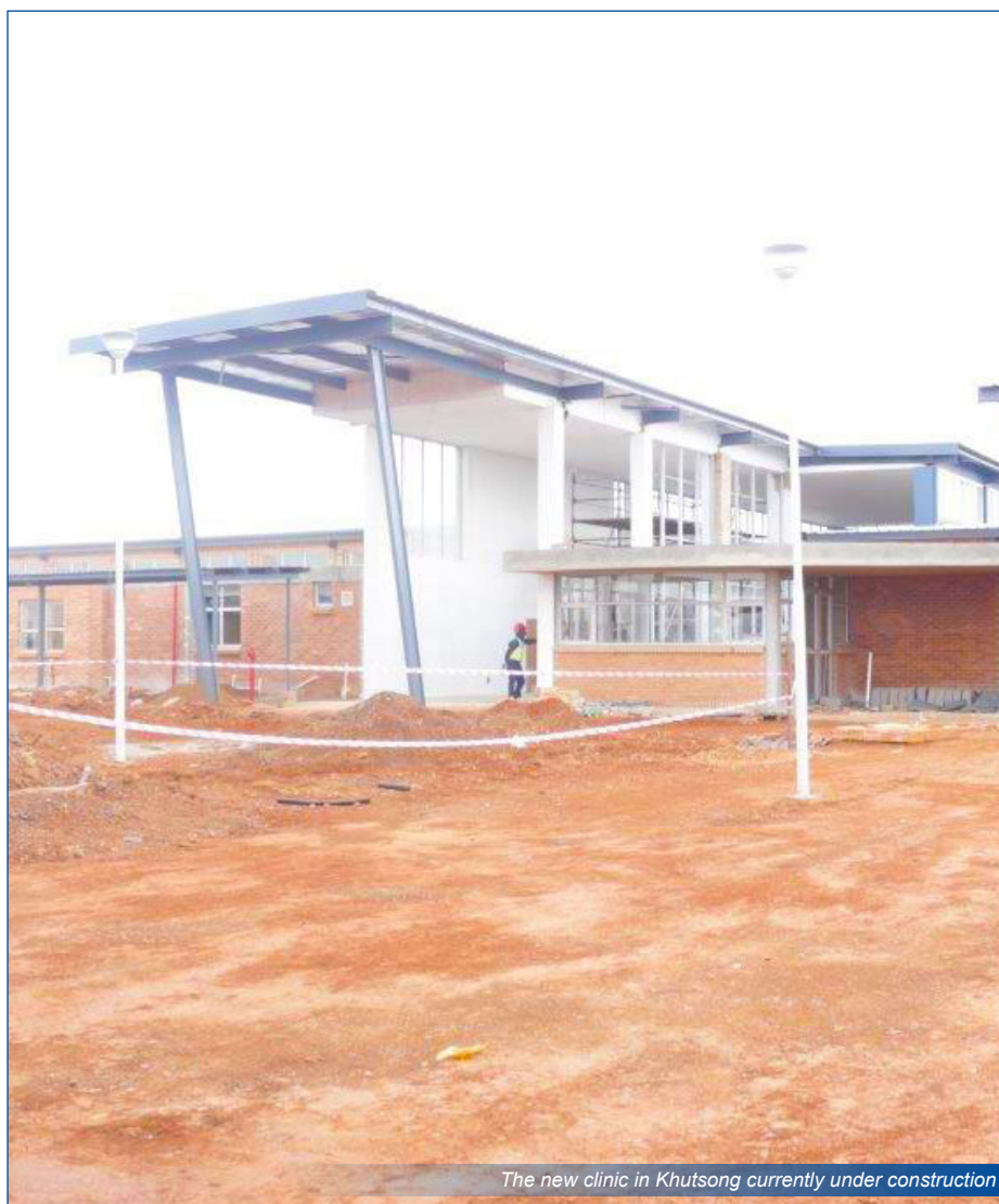
The new clinic in Khutsong currently under construction