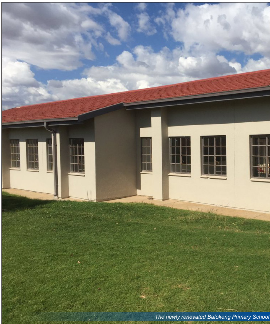
The newly renovated Bafokeng Primary School

The main contractor Letlapa Borwa Cavil's worked with twenty one (21) subcontractors in renovating the school. The project also benefited twenty (20) Extended Public Works Programme (EPWP) workers and two hundred (200) community members.