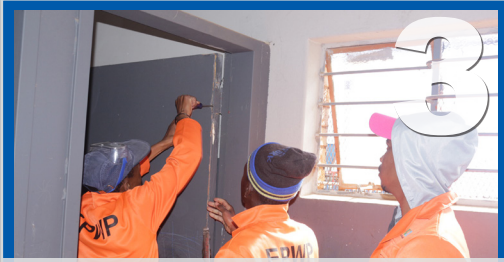
Moses Kotane Skills Centre in Summary