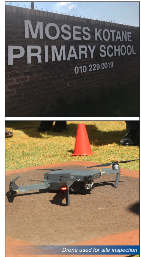
Drone used for site inspection

We are doing this because we are fully aware that Infrastructure is not just about brick and mortar. It is a question of how we build infrastructure in a way that will impact on the people and also change their lives for the better. The Infrastructure Delivery Management System (IDMS) continues to be the spine on whose back we are planning, designing, and implementing infrastructure projects in communities in view of rapid urbanisation and the high demand for community infrastructure. Accordingly, we have turned the department into a home of construction and built environment professionals by implementing the 80:20 technical versus administrative