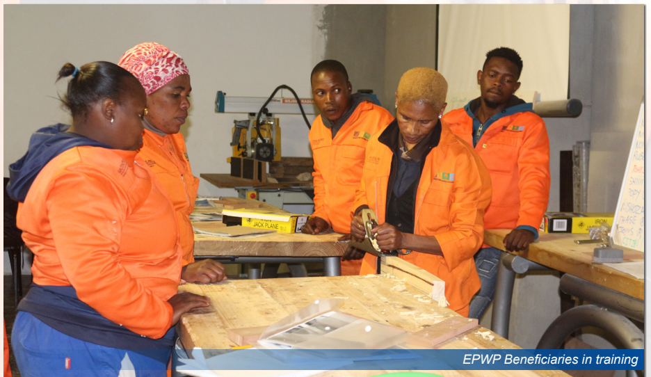
EPWP Beneficiaries in training