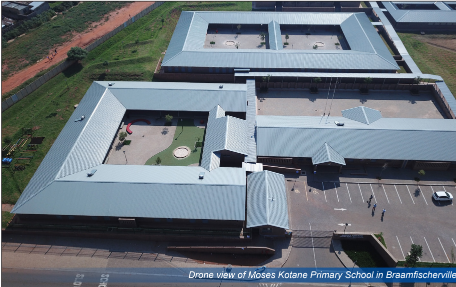
Drone view of Moses Kotane Primary School in Braamfischerville