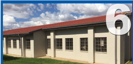
The newly renovated Bafokeng Primary School looks brand new