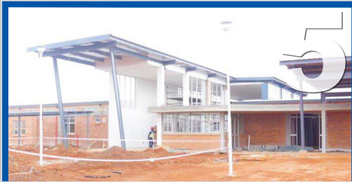
New public clinic under construction in Khutsong