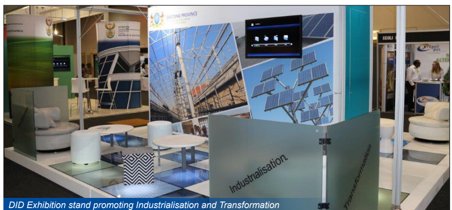
DID Exhibition stand promoting Industrialisation and Transformation

human resource capacity policy. We now have more than ninety registered professionals as well as sixty one candidates who are in the process of professional registration. We are also implementing an artisan development programme so as to build infuse more professional confidence in the capacity we deploy to client institutions such as clinics and hospitals. We have taken steps to ensure that smart technologies technology become an integral of the way our professionals plan, deliver and maintain infrastructure in Gauteng communities.