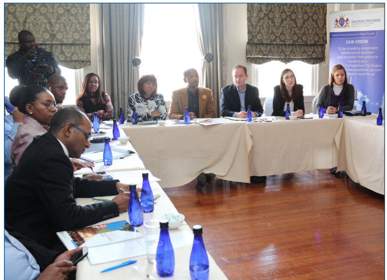
During the media networking session held at Emoyeni Conference Centre