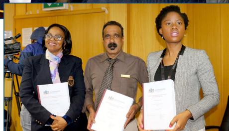
Hospital CEO's with the Report

"This is line with the delegation frame work, which will allow the CEOs to act, direct and ensure accountability. It will also help us to agree