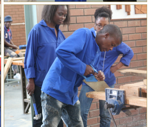
Students at Ekurhuleni East College