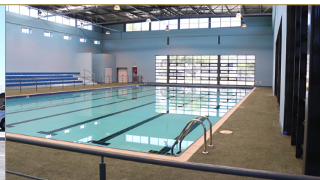
Nokuthula LSEN School