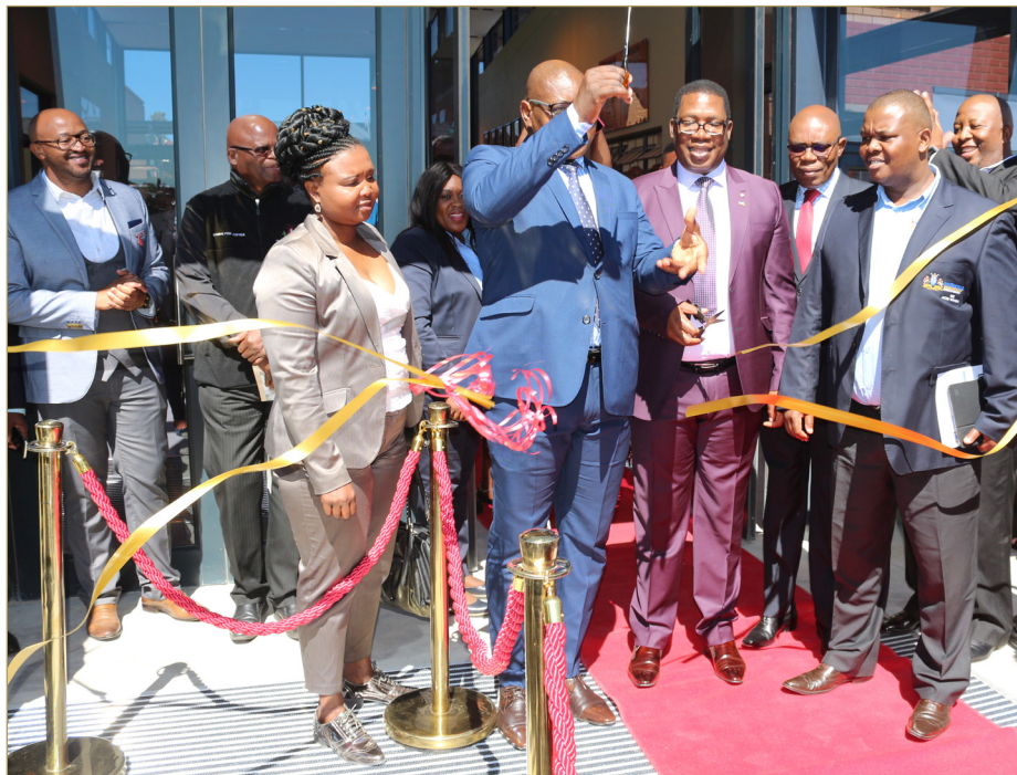
Premier David Makhura, Portfolio Committee Chairperson Lindiwe Lasindwa, MEC Jacob Mamabolo and MEC Panyaza Lesufi during the cutting of the ribbon.

The school is a sound, safe and environmentally friendly facility and thrives itself with the employment of the latest Green Building practices and acts as a resource centre for the district. This brings the total number of Autism-specific schools in the province to five with 13 Autism-specific units that opened at current special schools.