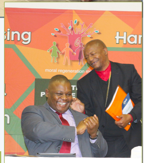
During the MRM consultative Imbizo with Gauteng Religious Leaders

Members of the public can also pledge online at www.icarewecare.co.za The province aims to mobilise One Million Pledges in support of the campaign.