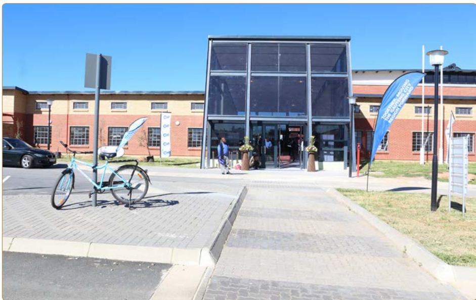
Nokuthula LSEN School handed over in 2017

We also developed in-house and implemented the ground-breaking Project Readiness Matrix, a critical tool that tests the viability of projects for implementation so as to avoid wastage of resources. We also responded promptly to the unfortunate circumstances such as the collapse of the overheard entrance roof at the Charlotte Maxeke Academic Hospital whereby we swiftly