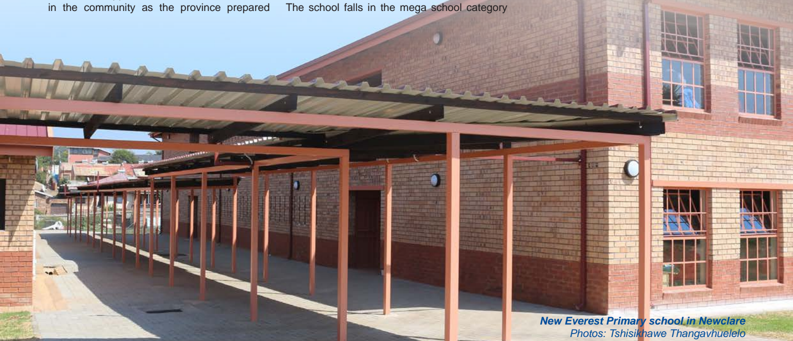
New Everest Primary school in Newclare

The project also provided skills through training and employment for participants of the EPWP. More than four million rand (R4million) was also spent on local labour from underlying communities.