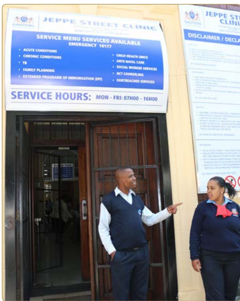
Jeppe Clinic and Randgate Clinic both handed over in 2017