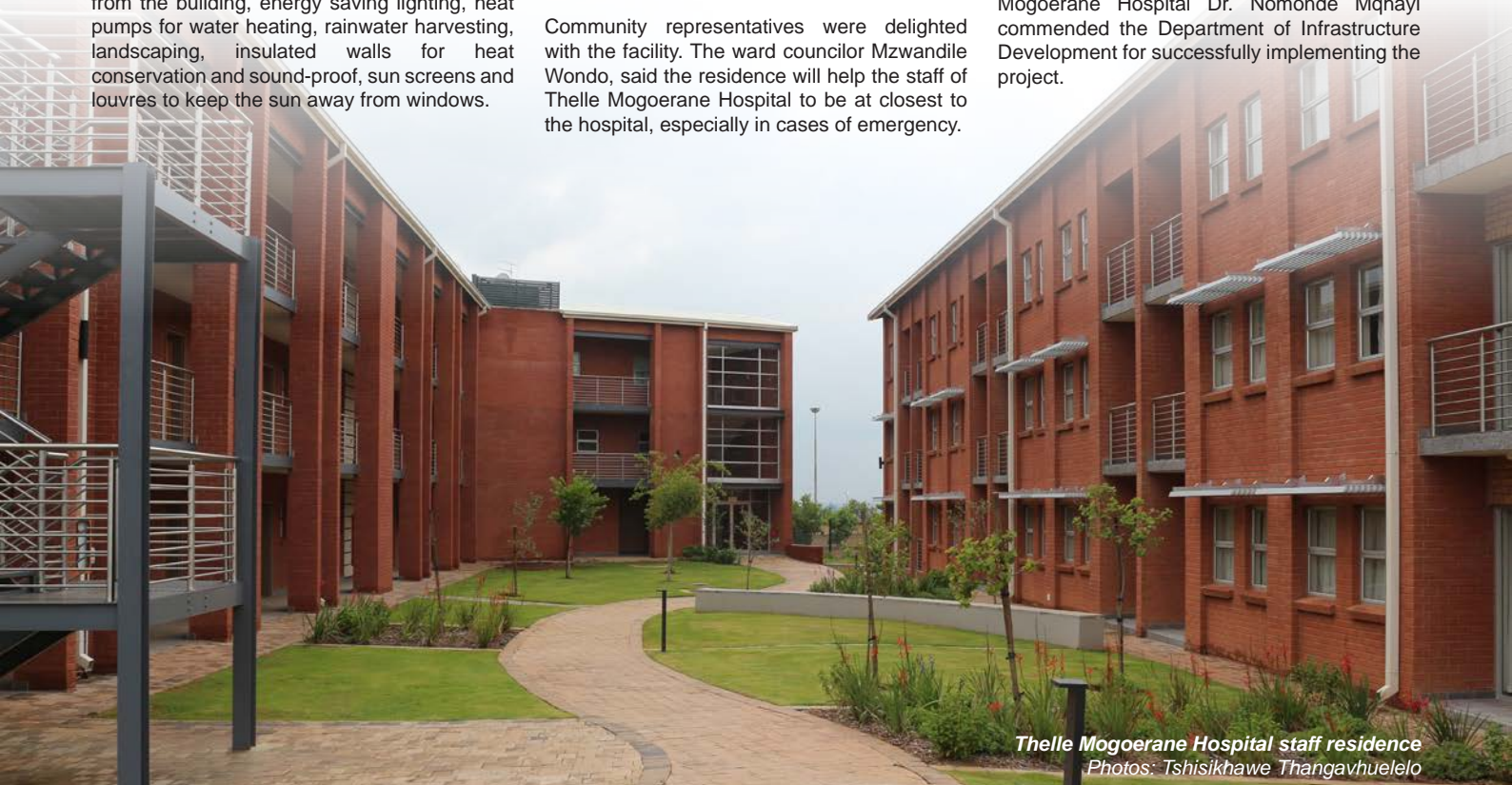
Thelle Mogoerane Hospital staff residence