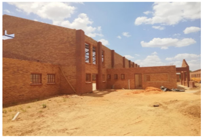
Inkhululeko Yisizewe Primary School