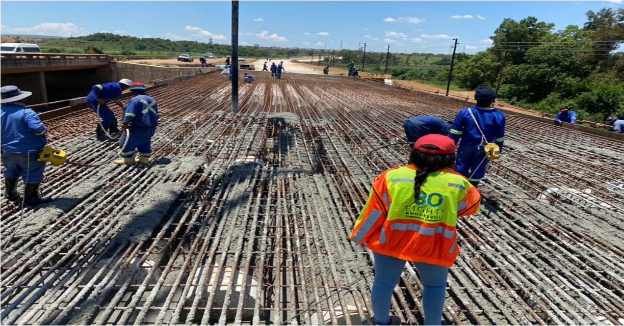
Rehabilitation of road D483 between P6-1 (Bapsfontein) and D713 Cullinan