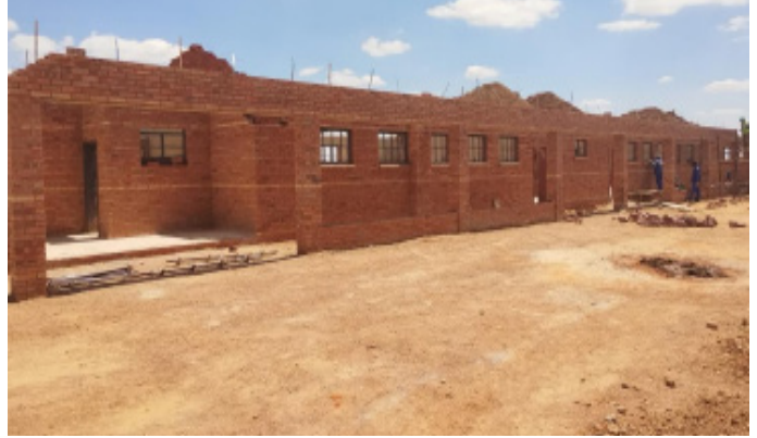
Ribane Laka Secondary School