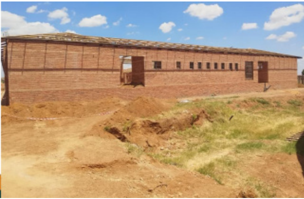
Semphato Secondary School