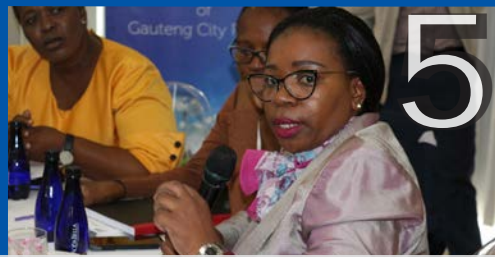
Department celebrates International Women's Day