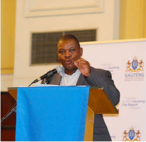
By Rorisang Monyela and Thomas Lethoba

The delivery and maintenance of new and old public infrastructure is just as important for Gauteng communities as is equitable access to opportunities in government programmes. The provincial government is also committed to the reclaim and conversion of hijacked buildings into livable precincts that will improve the quality of life of residents. The province is also encouraging entrepreneurs to take the initiative and create new solutions to the economic challenges faced by the City Region instead of only looking up to government bodies.