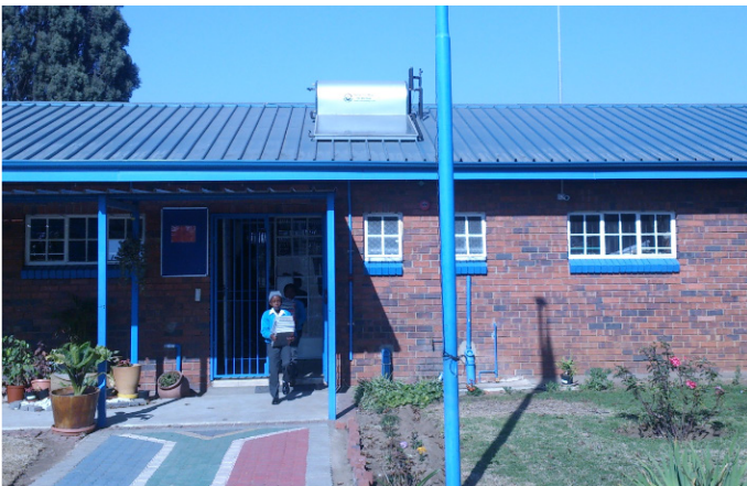
One of the schools where the AquaTrip was installed