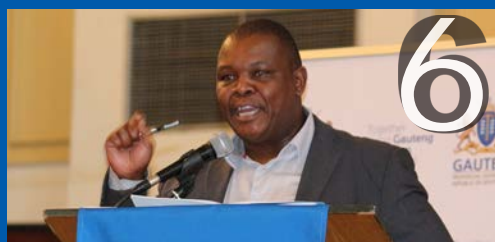
State of the Province community feedback held at Joburg City Hall