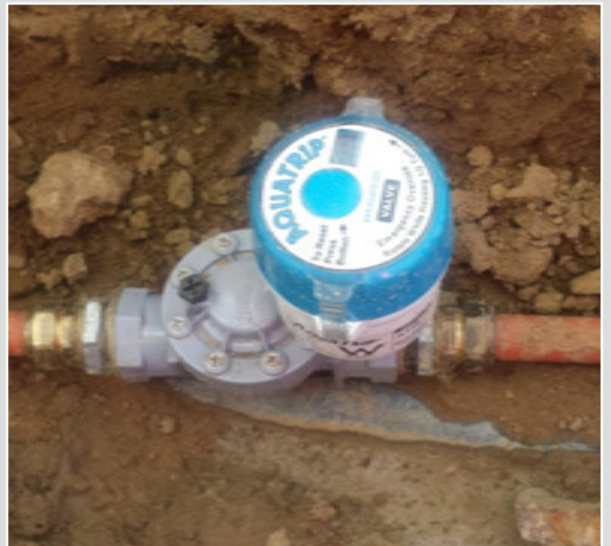
AquaTrip unit installed on the main line at Olievenhoutbosch Secondary School