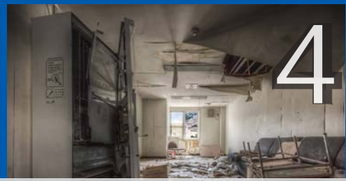
Vandalism of Olievenhoutbosch Clinic condemned