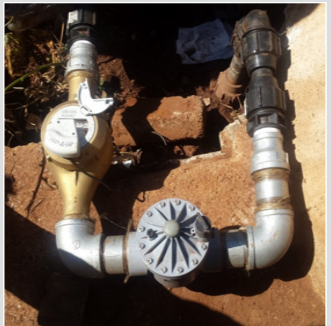
AquaTrip meter and datalog installed in the various five schools