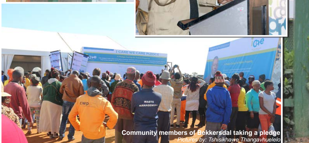
Community members of Bekkersdal taking a pledge