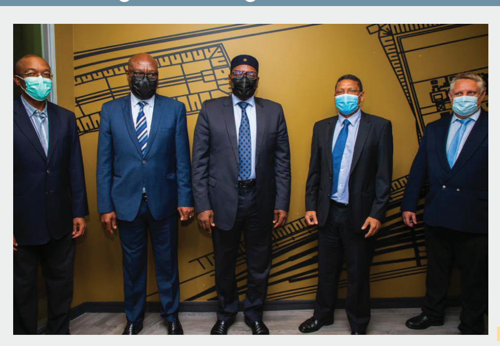
Premier Makhura meets with the City of Tshwane's executive

Local government is the sphere that is closest to the people, therefore its functionality and effectiveness are of critical importance to the strategic agenda of the province.