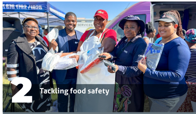
Tackling food safety