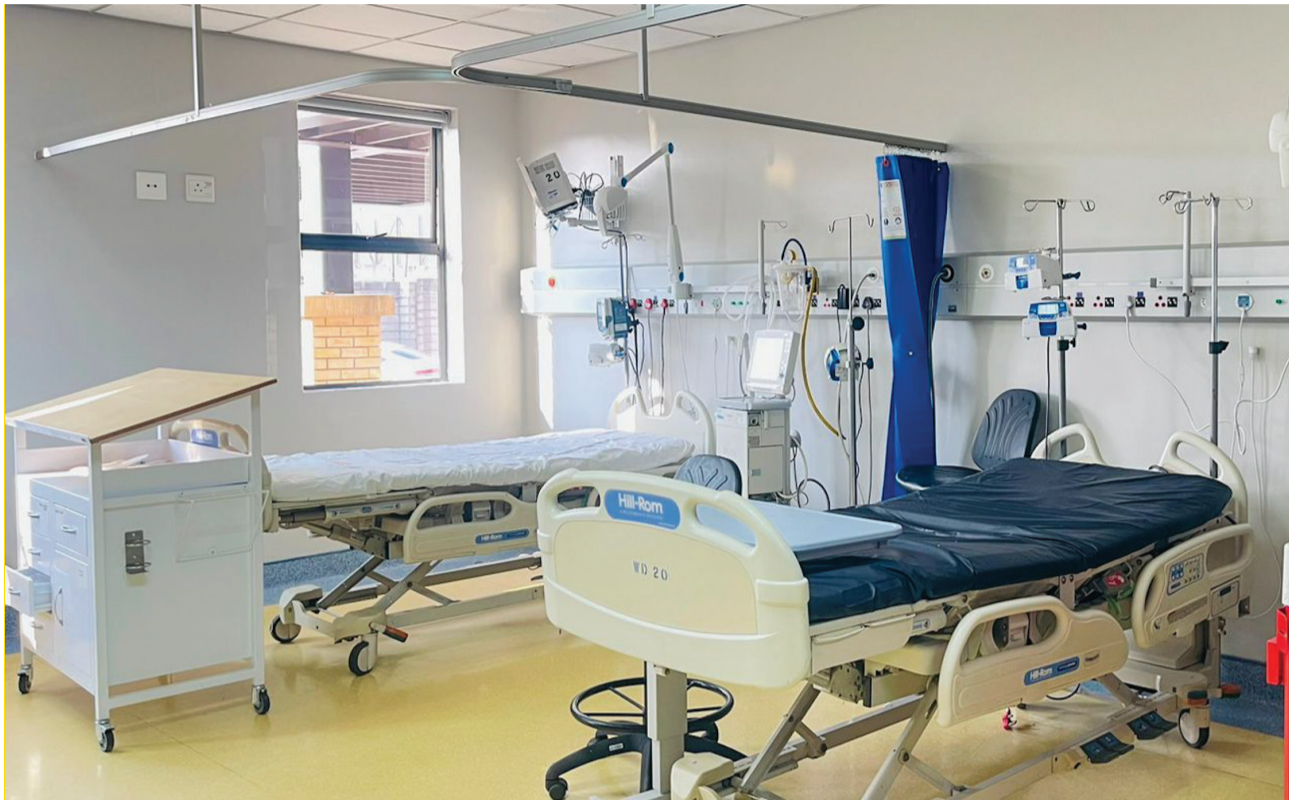
4 Gauteng hospitals get onboarded to Serve with a smile

The now modernised MACU with 22 beds is admitting and treating patients that need high care in a modernised and therapeutic environment. It is able to accommodate 8 ventilated patients plus patients on non-invasive ventilation, and those on high flow oxygen therapy.