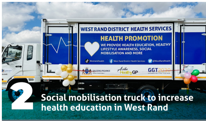
2 Social mobilisation truck to increase health education in West Rand