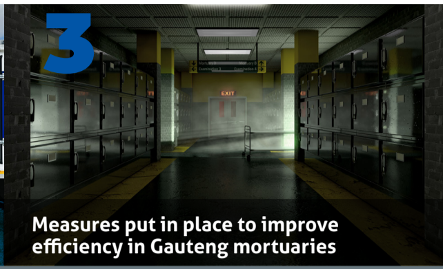
3 Measures put in place to improve efficiency in Gauteng mortuaries