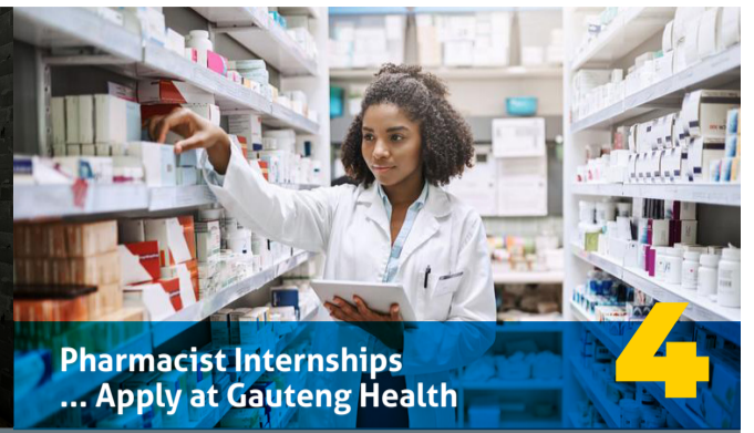
4 Pharmacist Internships ... Apply at Gauteng Health