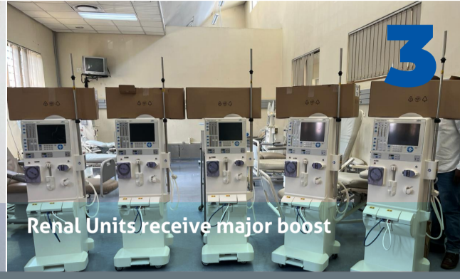
3 Renal Units receive major boost