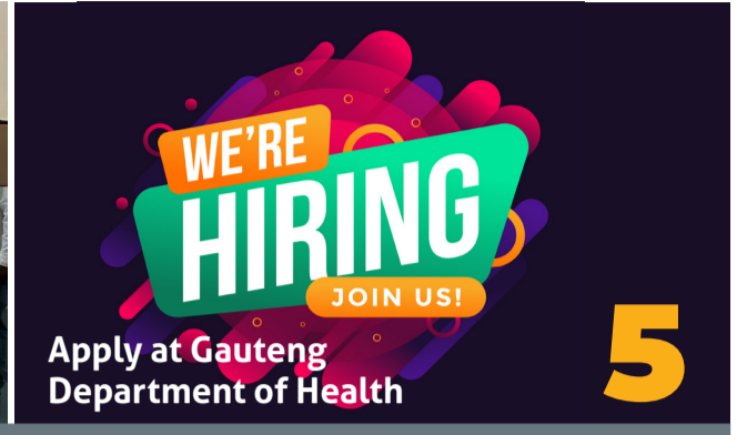
5 Apply at Gauteng Department of Health